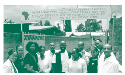
The staff of African Services' Shola Market testing center in Addis Ababa.

Broadening AIDS care and support services at the community level in Ethiopia is vital. With the support of Becton Dickinson, we have integrated CD4 testing at our Shola center and are providing referrals to care through a growing network of adult and pediatric AIDS treatment sites.