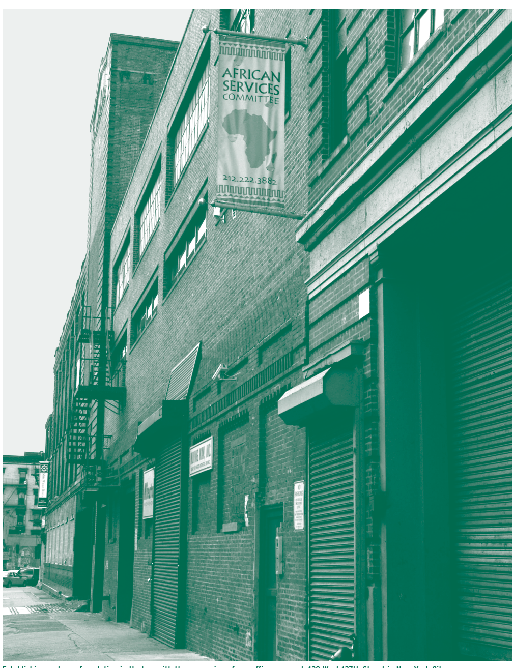
Establishing a strong foundation in Harlem with the expansion of our office space at 429 West 127th Street in New York City.