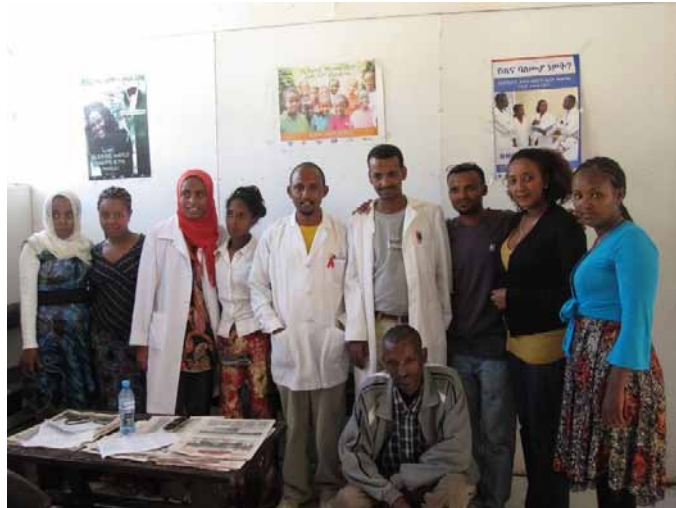
Kombolcha Clinic Staff

Kombolcha is one of the poorest cities in Ethiopia, where jobs are too few and government intervention and funding is still insufficient. African Services' Kombolcha clinic is located in the center of town in a large 2-floor office pavilion. The clinic is extremely well-run and the outreach staff dedicates large portions of their day to grassroots outreach initiatives and education throughout the community. This strategy has proven extremely effective in recruiting new patients to the clinic and disseminating information about the services provided. Access to rapid-HIV testing in Kombolcha has also transformed the clinic's ability to quickly provide the full gamut of needed services to those visiting the clinic.