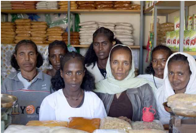
Several Clients pose in one of ASC's Small Business Projects

This article was featured on Voice of America: