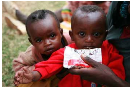
Image from a refugee camp on the Somalia/Ethiopia Border